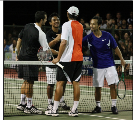
Action packed 2010 Men's Night Doubles Finals

Last year we set an attendance record and parking & seating was in high demand! Attend the event in style. Individual sponsorship passes for KRC members are just $155 for 1 pass or $300 for 2 passes! Just let us know and we can put it on your club bill.