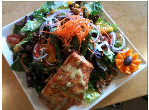
Salmon with orange vinaigrette, mandarin oranges, candied walnuts and fresh asparagus

that was recently served is my fresh seared salmon with a spring salad of mandarin oranges, candied walnuts, and asparagus spears with a tangy, orange-lemon vinaigrette. Dinners do not need any starch when they are this flavorful! But if you crave pasta, I always offer a cheesy vegetable or meaty style on Fridays, as well. Please check the KRC weekly update for what is being designed with you in mind on Friday nights at the Cafe, or give me a call.